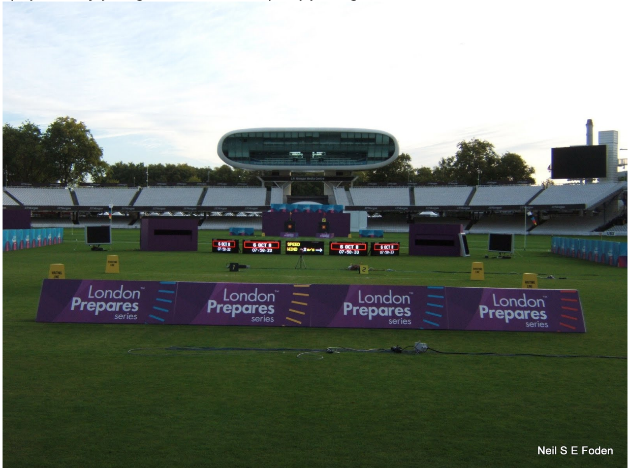
Neil S E Foden

I hope you all enjoy the games in whatever capacity you might be involved.